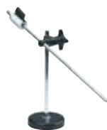
Order no: 292