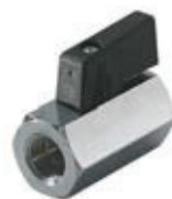
Order no: KV 18