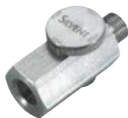
Order no: FV 18