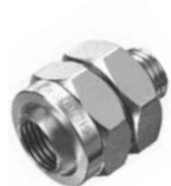
Order no: PSK 14