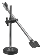
Order no: 294 W