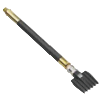
Order no: 220 W-280 W