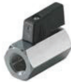
Order no: KV 14