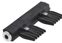
See page 92