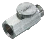
Order no: FV 14