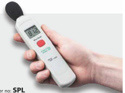
Order no: SPL

Is the noise exposure level too high? Is the noise level harmful? Over 85 dB(A)? Taking simple measurements in production is often the first step toward a better workplace environment. Order an SPL unit and start measuring.