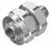
Order no: PSK 18