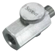
Order no: FV 18