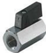
Order no: KV 18